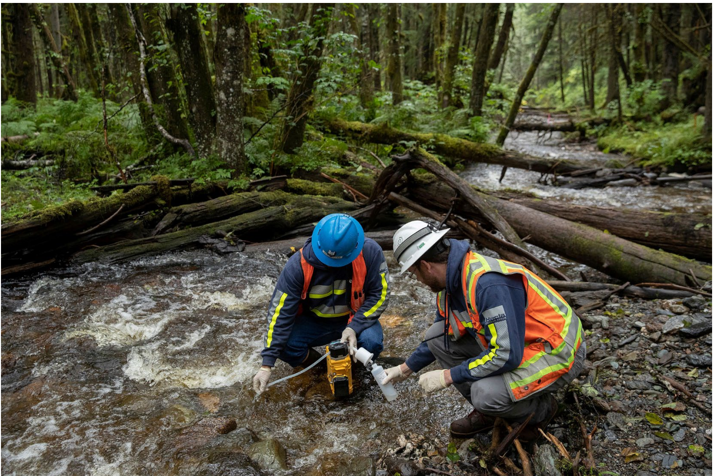
Figure 1: Hecla Mining Company, the operator of the Greens Creek mine in southeast Alaska, emphasizes environmental stewardship in its operations. Like many mining companies, it periodically conducts environmental monitoring to verify the effectiveness of their environmental protections and compliance with the State's high regulatory standards.

The Commission's role is to recommend strategies to mitigate constraints on mineral development in Alaska. Created by the Legislature in 1986, the AMC's authorization was extended through June 30, 2034 by the Legislature in 2023 via House Bill 103. Since its establishment, the AMC has worked with the State of Alaska and Alaska State Legislature to successfully implement key recommendations that support a strong and sustainable Alaska minerals industry. This report builds upon past work with the intent to identify state and federal issues that can block responsible development.