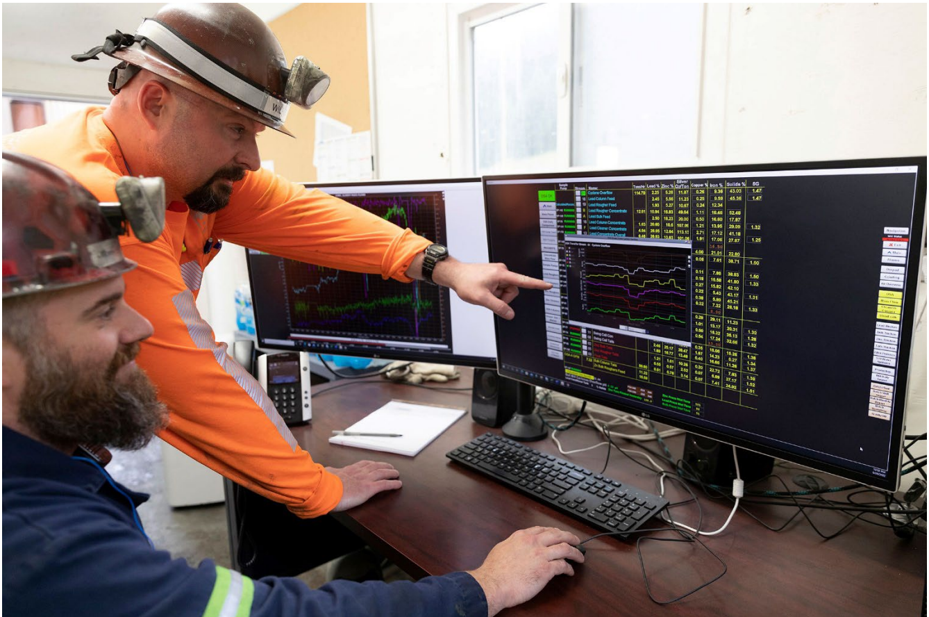
Figure 2: Mines invest in advanced technologies to minimize their environmental impact. This includes employing modern equipment and processes that reduce emissions, waste, and energy consumption.