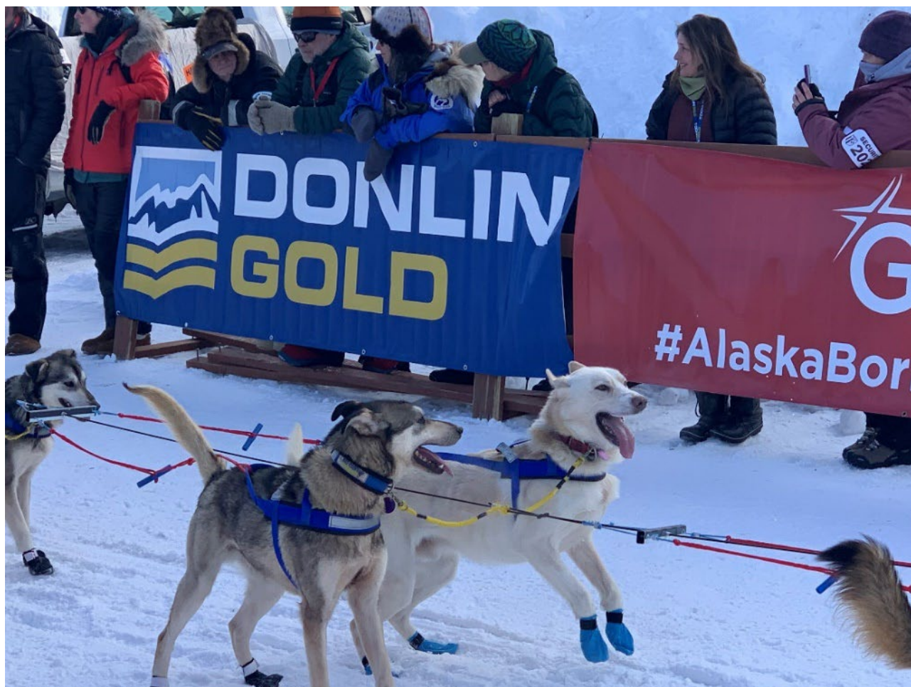
Figure 3: Mining projects regularly engage with local communities, seeking to understand concerns and address them. This can involve collaborating on environmental initiatives or supporting community development projects. In addition, companies often support social programs of importance to the communities where they operate.

The state's Division of Mining, Land and Water (DMLW) has recently solicited a Request for Proposals for an independent consultant to review the systems and workflows and recommend efficiencies. The analysis is meant to evaluate all of DMLW workflows including claim management and permitting. The Commission recommends that the DMLW encourage the selected consultant to fully consider developing an online staking and tenure management system for State of Alaska mining claims. The analysis will have to consider the legal barriers which may exist to implementing the online system. Also, a Cost-Benefit analysis should be done. If findings are positive, the State of Alaska should institute an online claim staking system with real time up-to-date claim map.