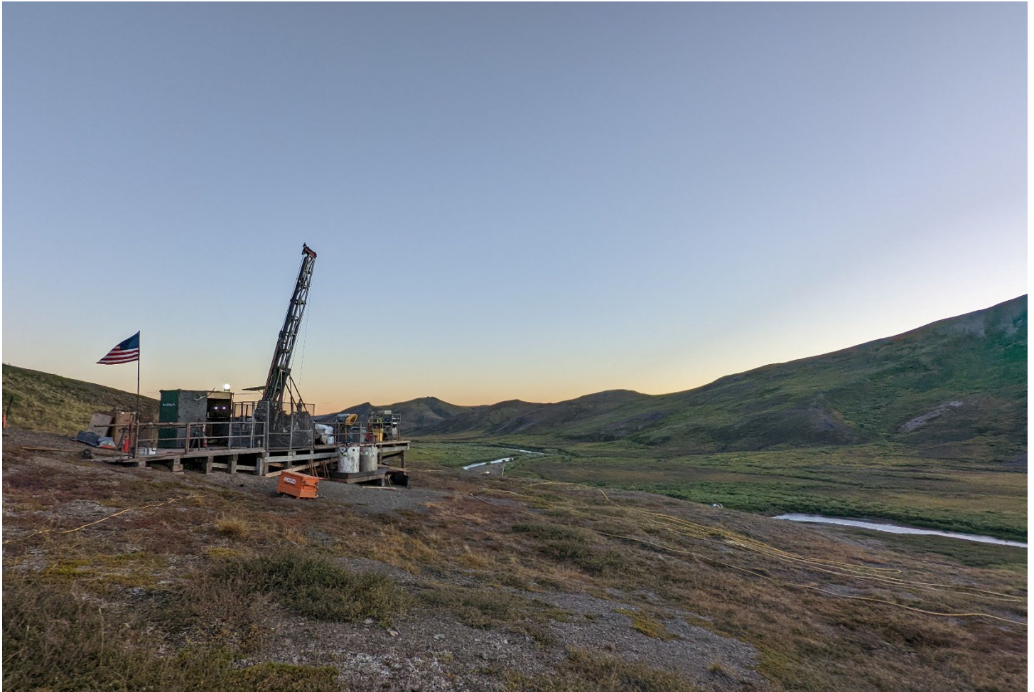
Figure 4: Mine exploration, the initial phase of discovering and evaluating mineral deposits, can bring potential benefits to local communities, although these benefits might not be as immediate or tangible as those during the operational phase, including: Employment opportunities, local business opportunities, infrastructure development, training and skill developments, increased economic activity, and community engagement and consultation.

The Alaska Minerals Commission appreciates the public’s interest in these issues and the support of the Alaska minerals industry. Please feel free to contact the Alaska Minerals Commission with comments or concerns at any time.